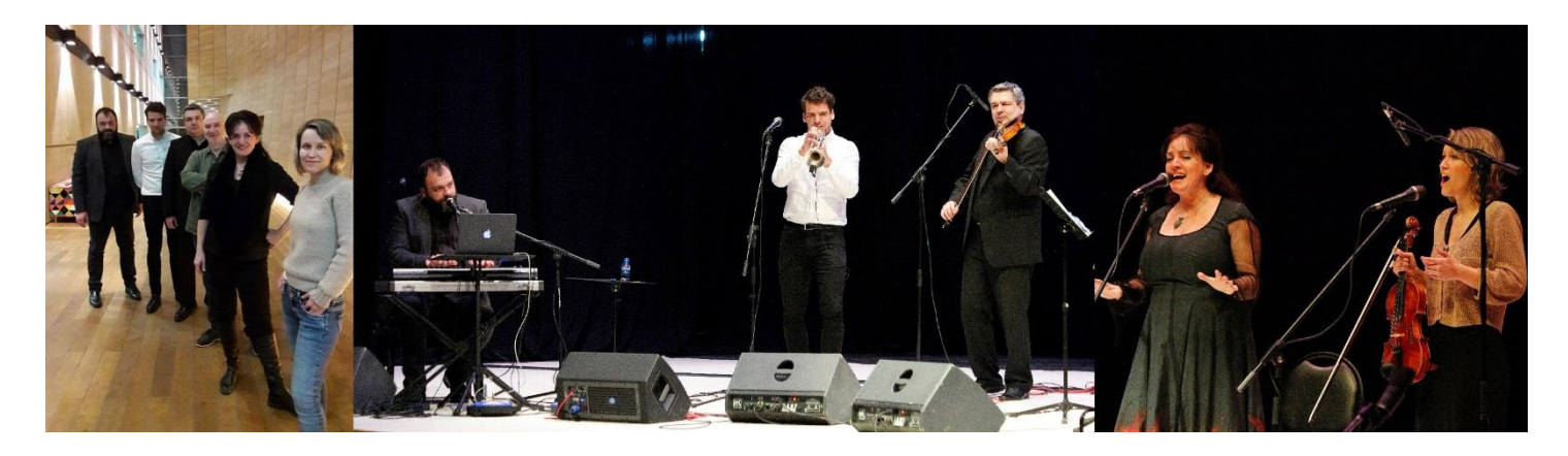
V4 GROOVE&VOICE BAND- V4 WORLDMUSIC PROJECT 2018